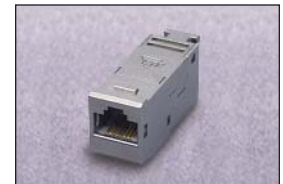
E-DAT size RJ45 to RJ45 coupler, 180° (optional)