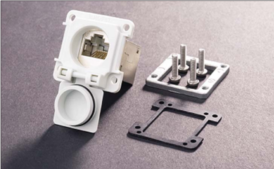
Installation Flange, E-DAT size industry IP67 (with Panel Mount Kit shown)